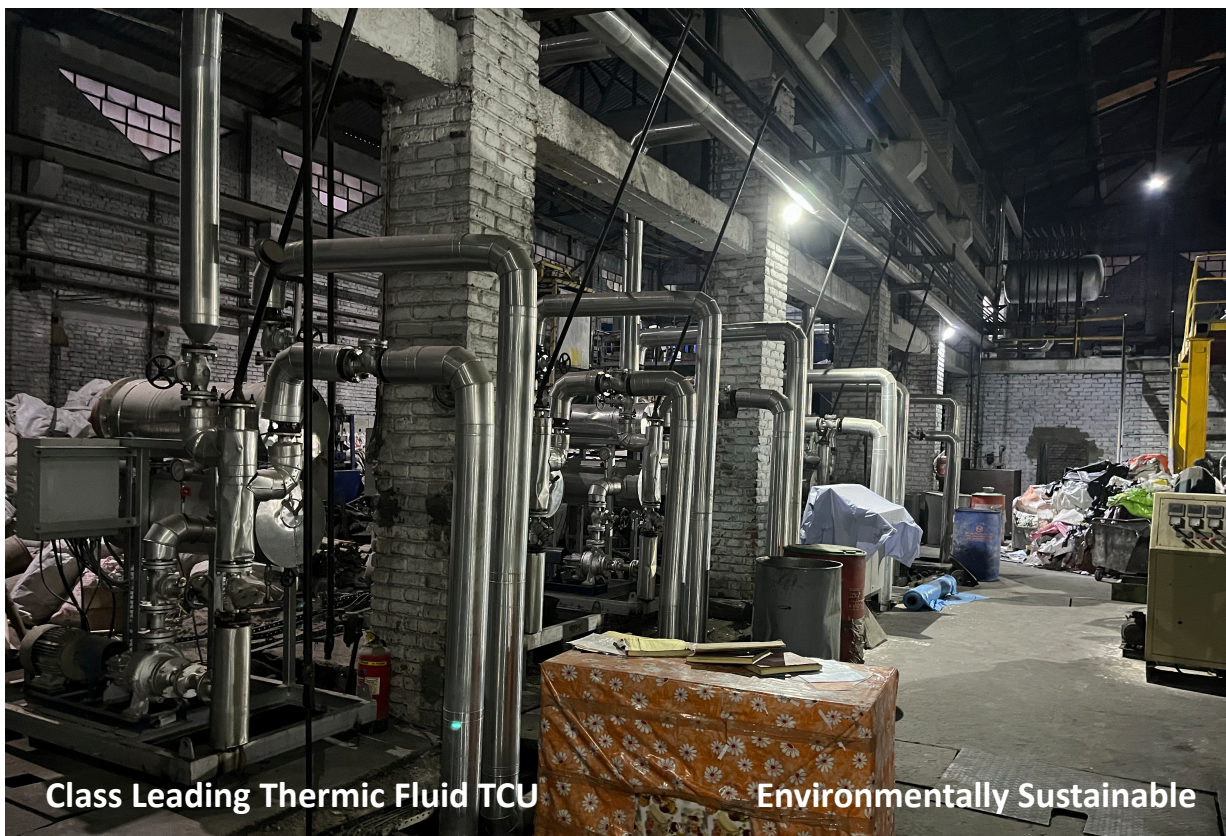
Class Leading Thermic Fluid TCU